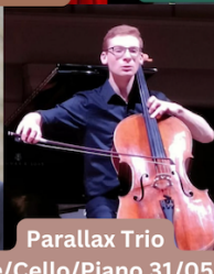
Parallax Trio Flute/Cello/Piano 31/05/26