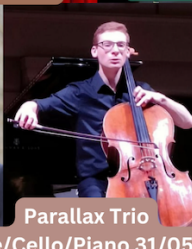
Parallax Trio Flute/Cello/Piano 31/05/26